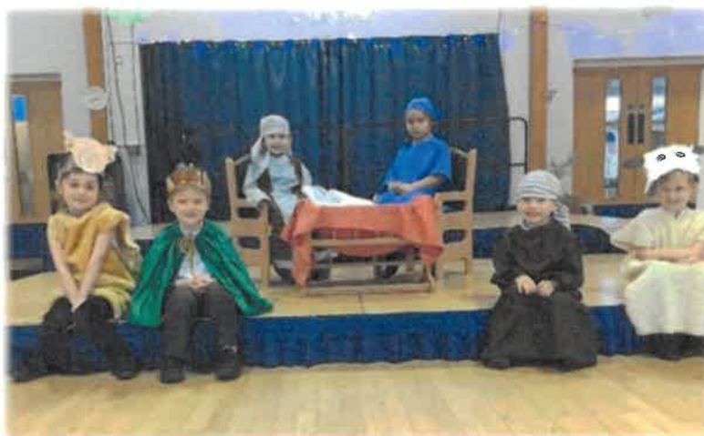
Reception children at The Round House proudly present their Nativity play

Merry Christmas and a Happy New Year from everyone at the Diamond Learning Partnership Trust!